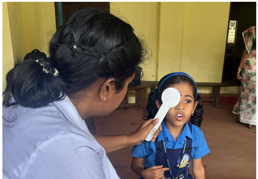
Regular school eye health programs and access to spectacles improve access to education. INDIA

Globally, it is estimated that only around one-third of people with vision impairment due to refractive error have access to a pair of spectacles that can effectively address their refractive error and allow them to see well. 1 In recognition of the fact that uncorrected refractive error is the leading cause of near and distance vision impairment worldwide, and that spectacles are a very cost-effective intervention, a new global target for refractive error was endorsed at the World Health Assembly in 2021. Specifically, the global target is to increase the percentage of people with access to appropriate spectacles (known as effective coverage of refractive error, or eREC), by 40 percentage points