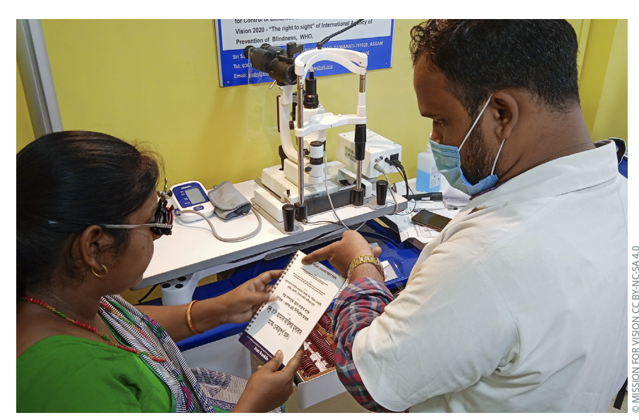
Near vision examination of a patient at Barpeta Vision Centre, Assam. INDIA

The vision centre serves a population of about 50,000 and is located in rented premises with an area of 340 square feet, in the market area of Barpeta town. People from surrounding villages, within a radius of 15 to 20 km, come to Barpeta market for various purposes and can then also access eye care facilities at the vision centre. The vision centre also organises two or three community camps each month in villages within a radius of 5-8 km from Barpeta. During these camps, screening, identification, and referral services are provided. Patients identified with cataract are referred to the tertiary eye centre in Guwahati for surgery, and those who require spectacles and/or further examination are referred to the vision centre in Barpeta.