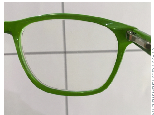
Figure 4 Lens aligned with a cross chart