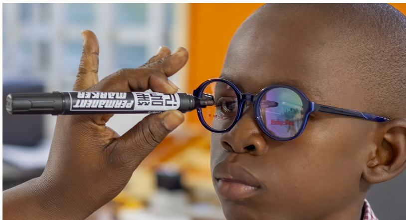
Figure 1 Marking the position of the pupil on dummy lenses. MOZAMBIQUE

The optical centre also plays an important role when prism is prescribed, usually for patients who have difficulty combining the images received from both eyes. Prisms can be created by decentering the lens in the frame; i.e., moving it so that the patient looks through the lens at a point away from the optical centre.