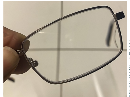
Figure 3 Lens not quite aligned with a cross chart