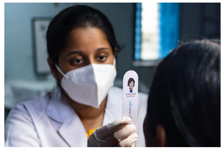
Figure 1 Assessing Binocular vision status. INDIA

Unless their hyperopia is corrected by the age of 7 years, children with clinically significant uncorrected hyperopia (defined as ≥+2.00D) are also at risk of developing strabismus and amblyopia, resulting in irreversible visual impairment in the affected eye.<sup>5,6</sup>