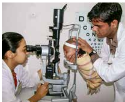
Examining a baby at the slit lamp. INDIA

Cataracts can sometimes complicate retinal conditions such as total retinal detachment or retinal dystrophies, which means that