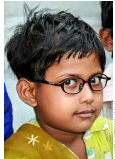
Child wearing executive bifocal spectacles after cataract surgery.

The World Health Organization recommends that there is one tertiary level child eye care centre with a well trained and equipped team for every 10 million population. Counsellors and experienced optometrists are very important members of the team.