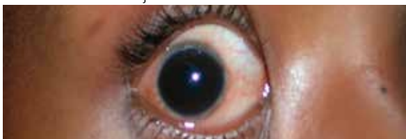
Figure 6 A child with chronic allergic conjunctivitis, also known as vernal conjunctivitis. INDIA