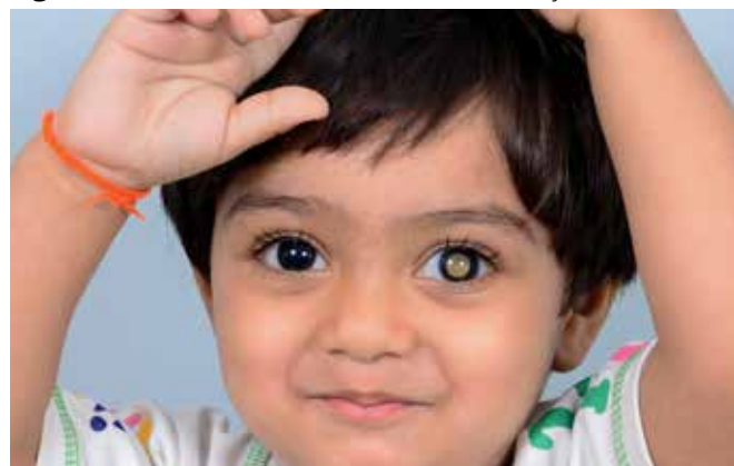
Figure 4 A child with retinoblastoma in the left eye. INDIA