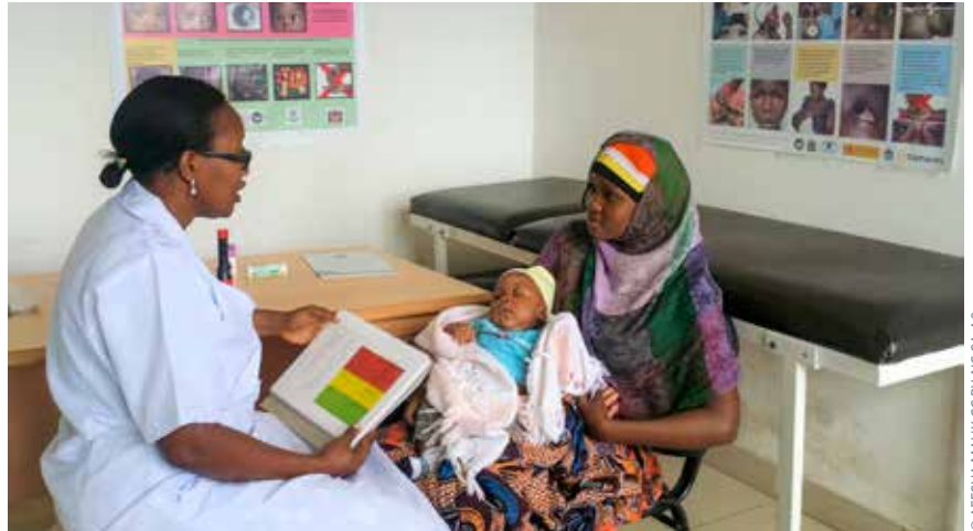
Believe parents when they say there is something wrong with their child's eyes. TANZANIA

Believe parents and caregivers when they say there is something wrong with their child's eye(s) or vision. As some conditions are blinding if not diagnosed and managed promptly, refer the child if you are in any doubt.