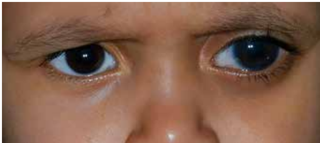
Figure 2 This child has congenital glaucoma in the left eye, which is larger than the right eye.