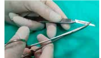
Figure 4 Using a clamp to remove a blade from the Bard Parker handle.