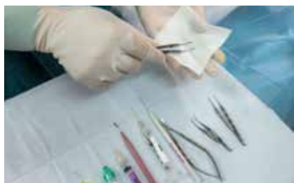
Figure 8 The scrub nurse/technician wipes surgical instruments after use with a soft lint-free wipe. VIETNAM