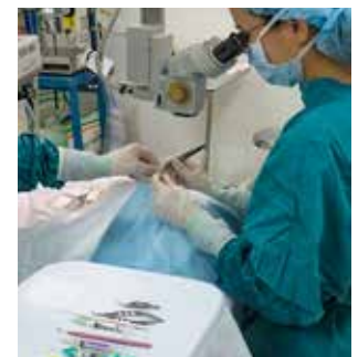
Figure 5 The scrub nurse/technician is positioned diagonally across from the surgeon. Passing instruments correctly allows the surgeon to work without having to stop looking through the microscope.