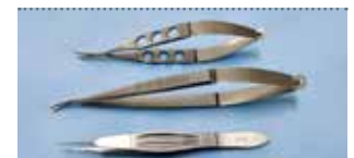
Figure 6 The grip section on the instrument handle has ridges or holes that allow surgeons to grasp them securely. Vietnam