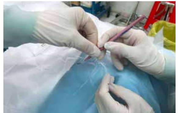
Figure 1 Passing a keratome blade to the surgeon with the sharp end facing away from them.